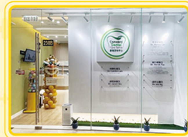
Conrad Dental Care Centre Shop 238B