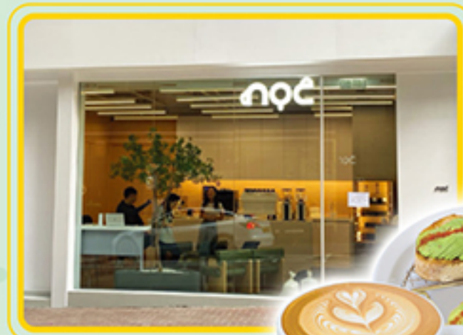
NOC Coffee Co. Shop 3-4