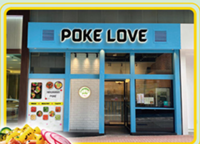
Poke Love Shop 1-2