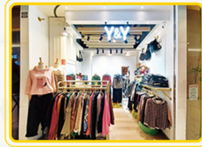
Y & Y Shop 2223