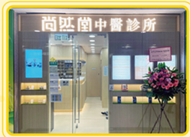
Prime & Naturals Shop 222