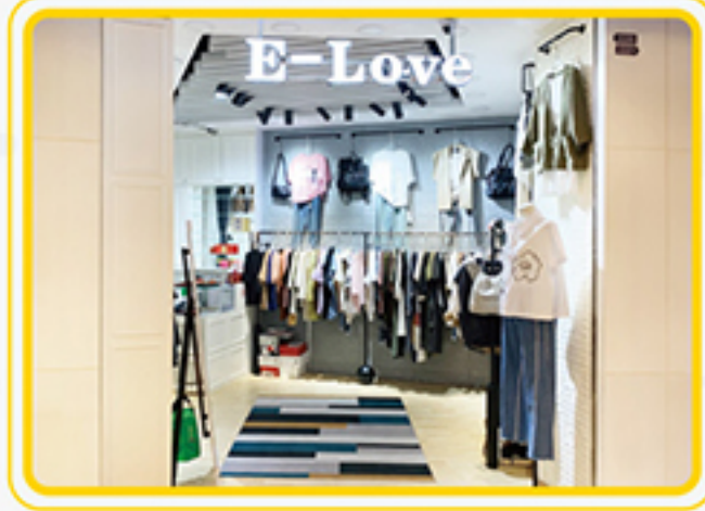
E-Love Shop 2220