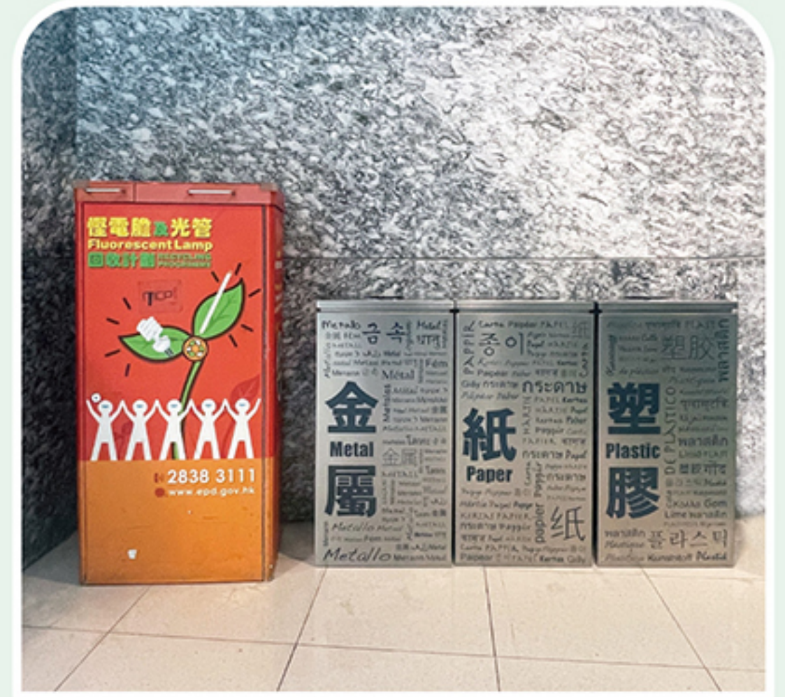
▲ Recycling corner at MCPI