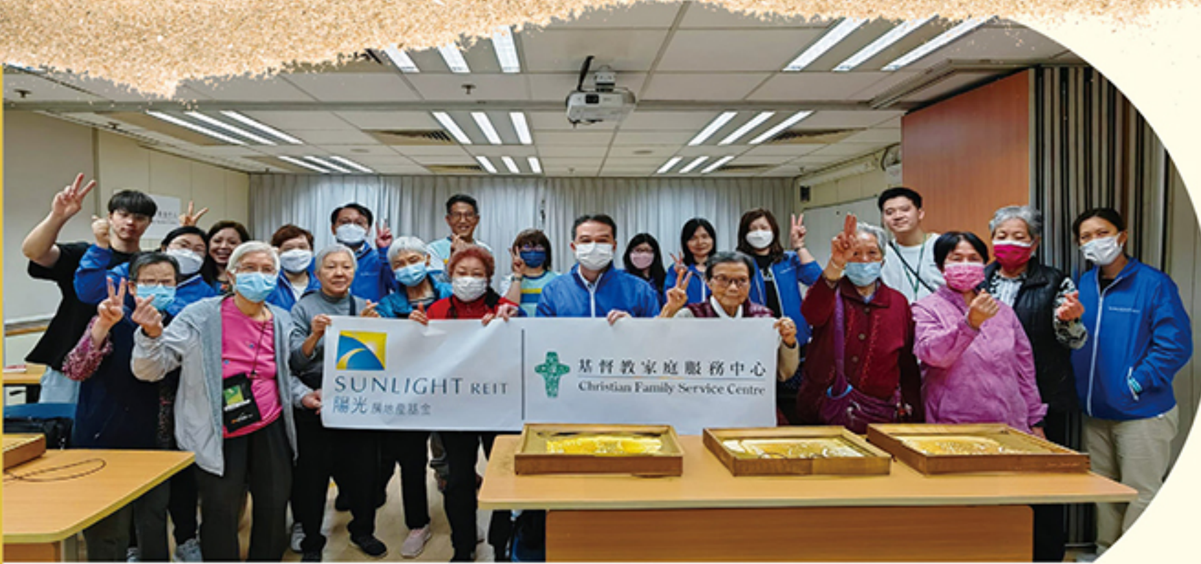
▲ The workshops received a warm reception with 36 elderly participants.

With a growing number of elderly living alone in Hong Kong, social support for managing their feelings and emotions is particularly important to mitigate the risk of mental health problems. With a view to providing a channel for the elderly to convey their feelings and emotions, we have partnered with Christian Family Service Centre to organize a series of sand painting workshops from November 2023 to February 2024 through which they can better express themselves in a natural way.