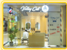
▲ Volley Cut Shop 216