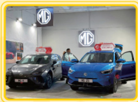
▲ MG Showroom Shop G35-36