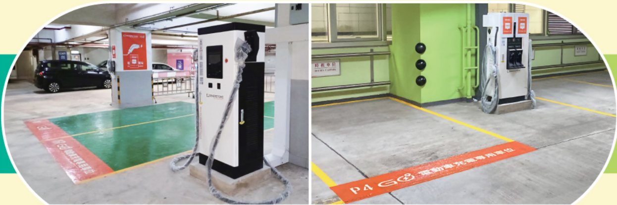
▲ EV charging facilities on G/F of SSC carpark | EV charging facilities on 3/F of DSFC carpark ▲