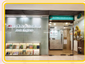
▲ JEI BrainKey Education Centre 206D-E