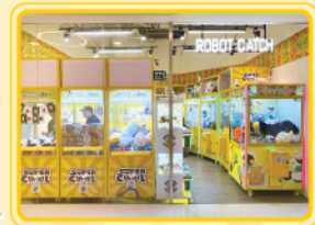
▲ Robot Catch Shop 271