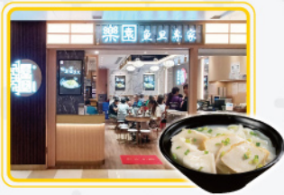
▲ Lok Yuen Fish Ball Shop 2002 - 2003