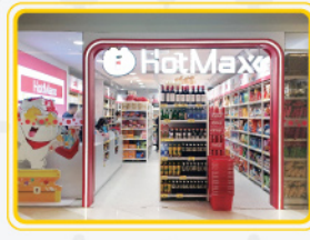
▲ HotMaxx Shop 2053