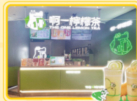
▲ The One Lemon Tea Shop 270