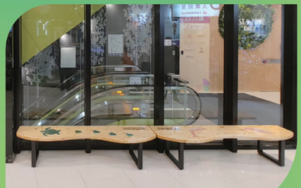
▲ Seating facilities on 1/F of W9Z

We have installed automatic lighting control to optimize energy efficiency at W9Z. In addition, we have increased seating facilities and offer wheelchair and baby stroller lending services to enhance shoppers’ experience. We will continue to uphold our dedication to operating our properties sustainably and extending the footprint of green-certified buildings in our portfolio.