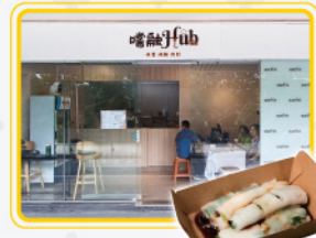
▲ 嚙融 Hub Shop 2230