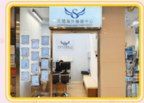
▲ Skysun Overseas Employment Agency 108C