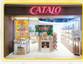
▲ CATALO Shop 2038A