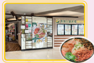
▲ Gui Yuan Siu Wok Mixian 205